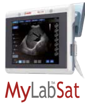
MyLab ™ Sat