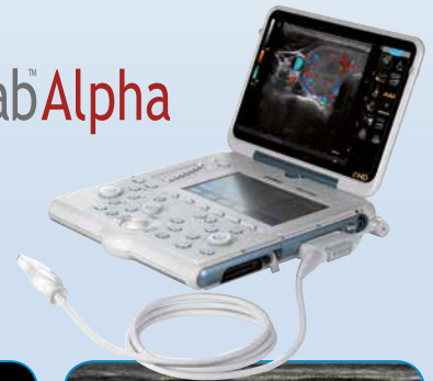
MyLab ™ Alpha