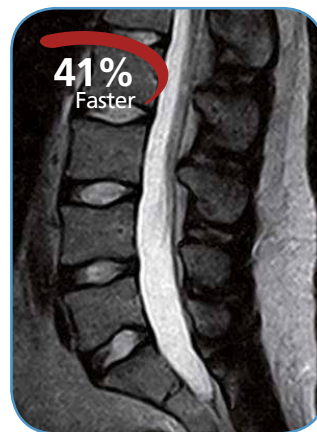
FSE-T2 @XP Technology