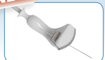
0 degrees biopsy-interventional probe