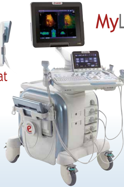
MyLab ™ Twice