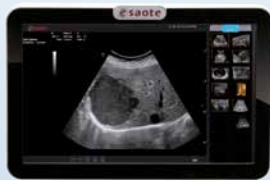
MyLab ™ Seven